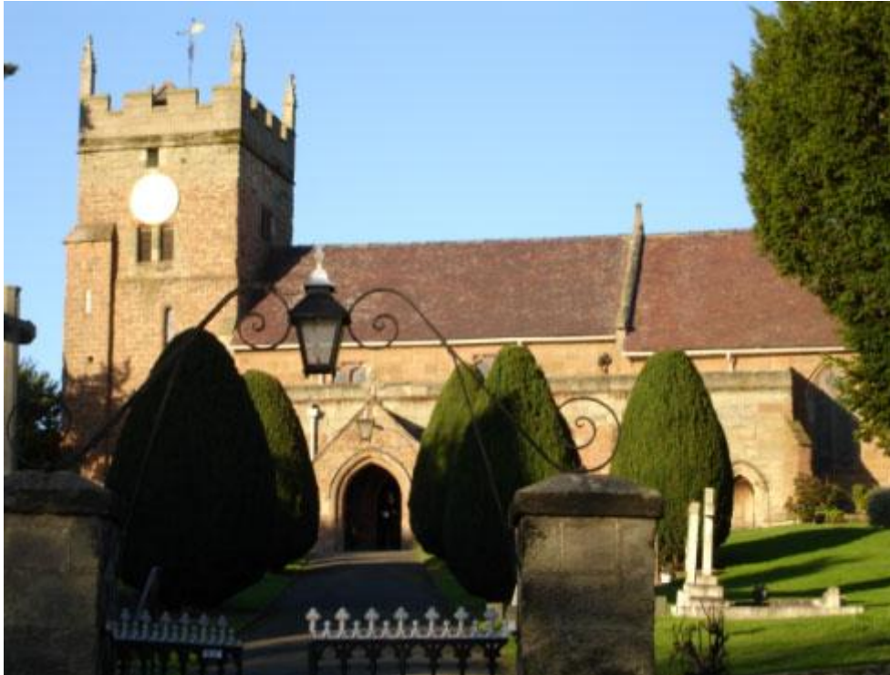
St. Mary's parish church in Cubbington.

Parents have the right to withdraw their child from Collective Worship if they wish to do so. Please make an appointment to see the Head teacher if you would like to discuss this.